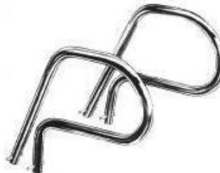
Figure 4 style combines functional beauty with considerable strength, suitable for both residential and public pools.